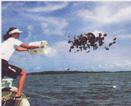
Reef seeding with juvenile oysters.

NCCF's oyster habitat restoration and creation projects have been made possible with the support of its partners, including NOAA's Community Habitat Restoration Program, FishAmerica Foundation, National Fish and Wildlife Foundation, Restore America's Estuaries, NC Sea Grant, NC Division of Marine Fisheries, NC Shellfish Sanitation Section, NC Division of Water Quality, the Albemarle-Pamlico National Estuarine Program, UNC-W and the NC Clean Water Management Trust Fund.