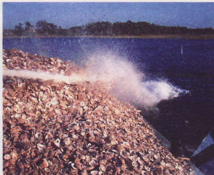
Spreading of oyster shells for new reef base.