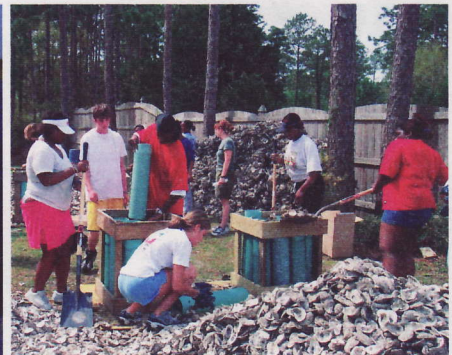
Volunteers filling oyster shell bags.